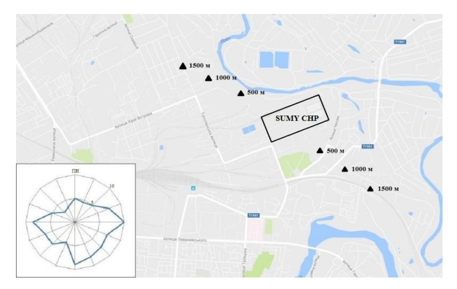
Fig. 2. Location of snow sampling points around Sumy CHP

The obtained data (Tables 1, 2) indicate that the location of Sumy CHP and significant height of pipes (62 m and 100 m) contribute to the "throw-over" pollutants. It explains the maximum concentrations of pollutants within the distance of 1000 m.