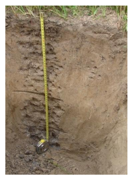
Fig. 4. Soil profile