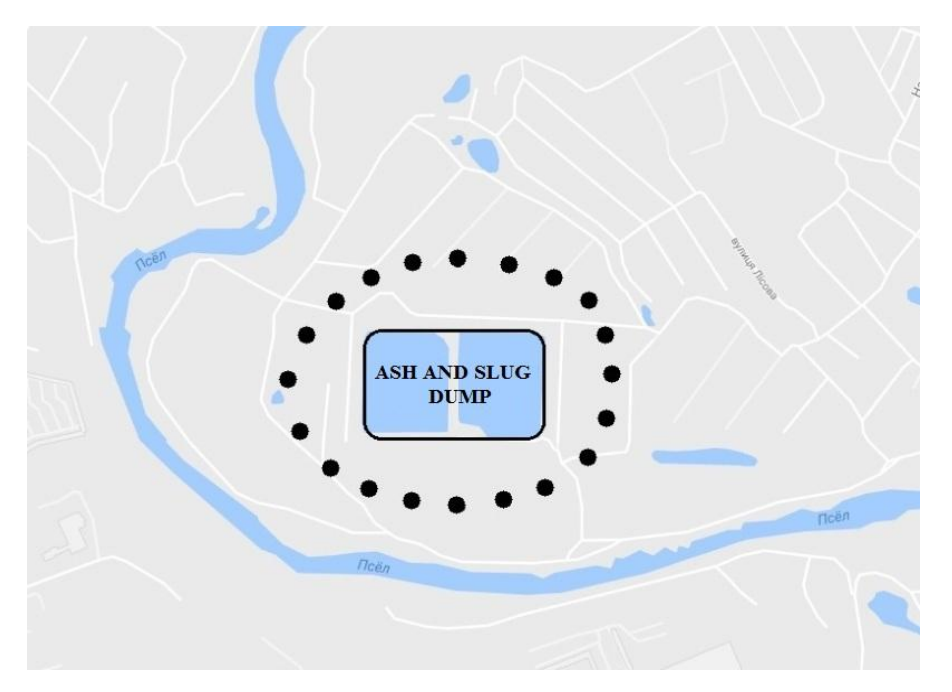
Fig. 3. Soil sampling points in the area of ash and slug dump