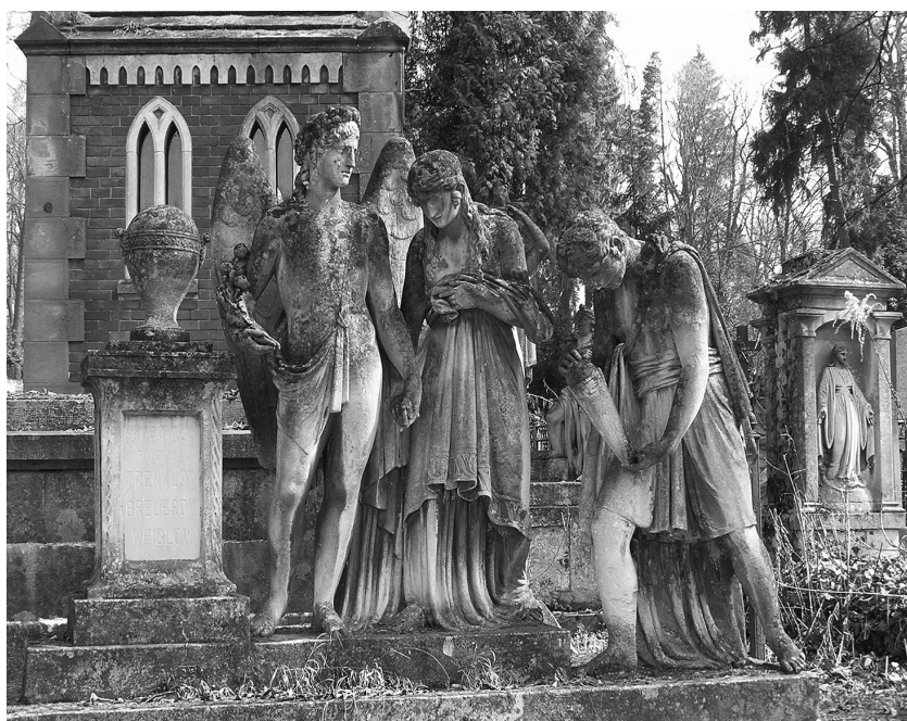
Fig. 1. A. Schimser. Tombstone of the Breuers, Trenkels and Weigls families. 1820–1825

The decorative-monumental forms – such as decorative design of residential, public and administrative buildings, decor of churches, sepulchral plastic art – generally prevailed in Lviv throughout this entire period of time. With the occasional exceptions, the portrait and narrative indoor sculpture has not attracted any serious attention of the artists yet. The Lviv artists from the 1800 to 1840s strengthened their regular links with western countries, travelling across the continent and studying in the best studios and academies (including in Vienna, Munich, and many Italian cities). They also absorbed progressive inventions of the best masters of the European classicism, including A. Canova and B. Thorvaldsen. The new trends and technical innovations spread widely and quickly into the sculptures of Lviv. Local plastic art reacted in this manner to international art novelties, supplementing them with its own ideas.