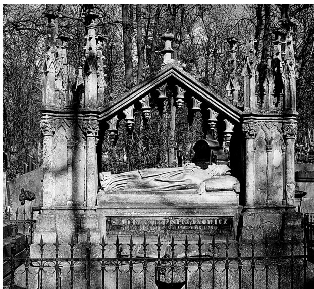
Fig. 2. P. Eutele. Tombstone of the Archbishop Samuel Cyril Stefanowicz. Circa 1859

During 1899 to 1900, Wojtowicz created the statues on the fronton and inside the above mentioned City Theatre (Opera House). At the beginning of the 20th century, he created the figures on the facade of the railway station and on the front of the Museum of Art Industry. He also produced the statue of St. Florian crowning the Fire Station building, six allegoric figures on the front of a town house at 19 Sykstuska Street (now Doroshenko Street) and the atlantes on the building at 11 Romanowicz Street (now Saksaganski Street). The architect Teodor Talowski had engaged the sculptor to decorate the facade and interior of St. Elisabeth Church in Lviv. From 1908 to 1910, he created the “Crucifixion” group on the facade, before creating the three altars from 1913 to 1917, which included a huge altar of St. Joseph. The altar was composed of several dozen figures – these were original, monumental masterpieces. Unfortunately, they were destroyed after 1945. The architectural sculpture of the last third of the 19th century reflected its “free choice” of various historical stylistic prototypes.