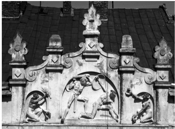
Fig. 7. T. Orkasiewicz. Relief on the pediment of the house n. 54 of Tarnavs'kyi Street. 1913

Compared to the 19 th century, sculptured portals, facade relief and decorations of the entrance space of the buildings are interpreted in a new and different way. Cement, concrete and especially artificial stone – a new material – are widely used for the monumental decorations.