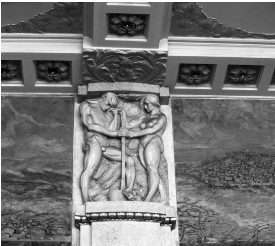
Fig. 6. Z. Kurczyński. Melancholy. Sculpture in the former Chamber of Commerce and Industry. 1909

Harmonious interaction with the architectural space was characteristic of the monumental sculptures of the early 20 th century. They were often filled with a sophisticated allegoric, fabulous-topical content. The form of sculptural attics essentially changes, in comparison to the preceding period. These forms become diverse patterns, creating important symbols for architecture (Fig. 7).