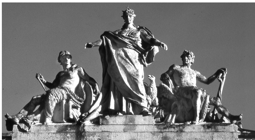
Fig. 5. T. Rygier. Allegoric group on the attic of the former Diet of Galicia. 1881

Produced during the period from 1880 to 1882, the artists who sculpted the main figures won a contest. The main figures made of hard sandstone were carved by Teodor Rygier. In 1881, he installed the large (4×7 m) group “Lawmaking patronage of Galicia,” which represented Galicia, Dnister (Galician Ukraine) and Vistula (the Polish part of the province) (Fig. 5).