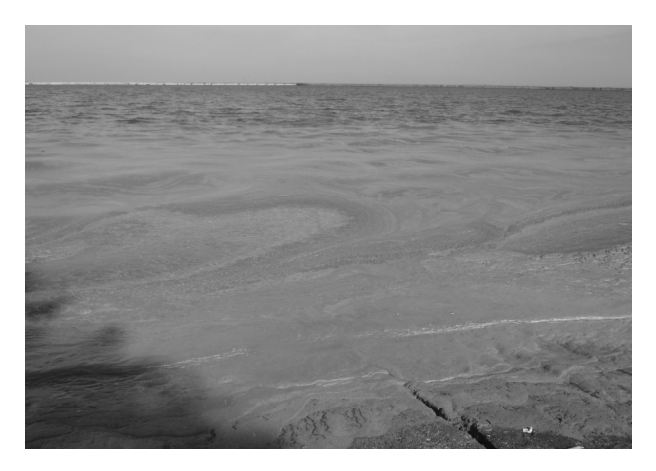
Fig. 1. The Accumulation of blue-green algae near Kremenchug hydroelectric station

The nature of the biological cycle of life and death of blue-green algae causes a dominant role in the ecosystem of the Dnieper. Since blue-green algae do not need the soil environment, their quantities are not affected by the depth of the reservoir. Therefore, under the influence of the wind blue-green algae (Fig. 2), migrate along the reservoir, which creates conditions for their progressive reproduction.