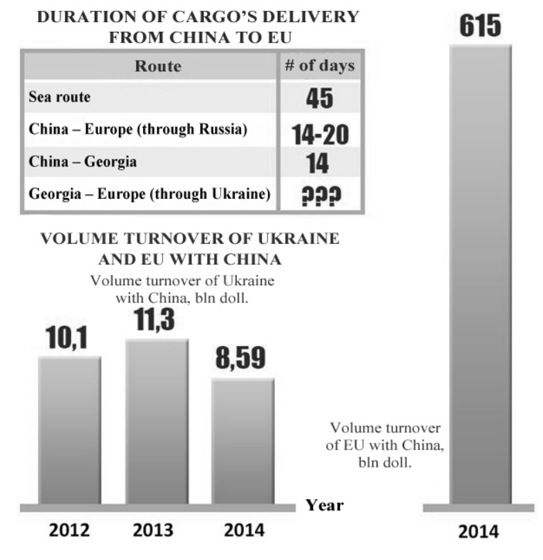
Fig. 1. Duration and volume turnover

However, the existing sea routes, their high dependence on weather conditions and the duration of cargo delivery is not a competitive point comparing with the delivery of goods through the territory of Russia. Due to this at the beginning of 2016 was launched the project of a new direction "Silk Road" (fig. 2). From Illychivsk was sent a half-empty train with 10 wagons and containers for the purpose of analysis of all risks and duration of the planned route. The duration of the trip had to be 11 days (versus 45 days – by the sea, and 14 days for the route: Georgia-China). Despite the declared duration – the goods reached the final destination in 15 days and until present days (October 2016) stands in China. Despite the alleged perspectives, short time delivery and ease of implementation (the distance of cargo delivery could be reduced and infrastructure facilities of all countries has working status) the project has not received support in the business.