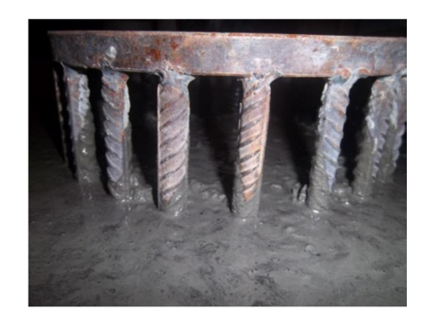
Fig. 3. Breaking capacity of self-compacting fiber reinforced concrete mixture

Self-compacting concretes are used for concreting highly reinforced constructions, so the filler capacity of prepared self-compacting fiber reinforced concrete mixtures was determined in the work in terms of fluidity and visual J-ring method. Determination of the capacity for self-compacting according to J-ring method showed excellent ability of self-compacting fiber reinforced concrete mixtures obstacles to overcome closely set reinforcing rods without blocking (Fig. 3). It has been found that the obtained self-compacting concrete mixtures reinforced with basalt fiber, are characterized by high density (average density of concrete mixture is 2400-2425 kg/m3) and low air consumption (0.35%).