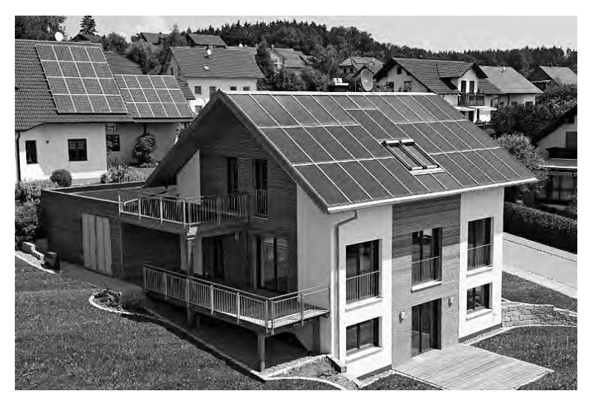
Fig. 1. Solar panels form the plane of the roof [9]

Presently such elements are eg. solar panels (Fig. 1) and solar roof tiles (photovoltaic tiles) (Fig. 2.) which due to their shape do not disturb the current construction methods and traditional form composition of buildings.