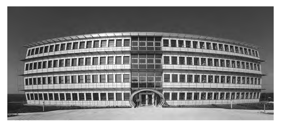
Fig. 5. Energon: smart passive office building in Ulm, area 6000 sq ft, Germany. The front elevation. [17]

Of particular interest for our topic is a building that is passive and intelligent at the same time. It was built in 2002 in Germany in Ulm as the largest passive office building known as "Energon" (Fig. 5, 6, 7). Energon was built on a large strip of land in the middle of a scenic park, surrounded by bodies of water – ponds collecting rainwater from the roof of the building. The building has an area of six thousand square meters. It is a place of work for 420 people. Thanks to the technologies used it consumes only 25 percent of the energy for heating, air conditioning, etc. normally needed in this type building.