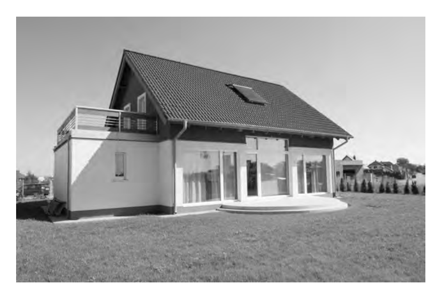
Fig. 4. In Poland, the first demo house certified as passive was built in Smolec near Wroclaw by copyright office project Lipińscy The Passive House and developed in collaboration with specialists from the Institute of Passive House at the National Energy Conservation Agency [15]

In a passive house the thermal comfort is ensured by passive heat sources that used to be underestimated. These can be people, electrical equipment, heat from the sun and the heat from the ventilation that is by recuperation.