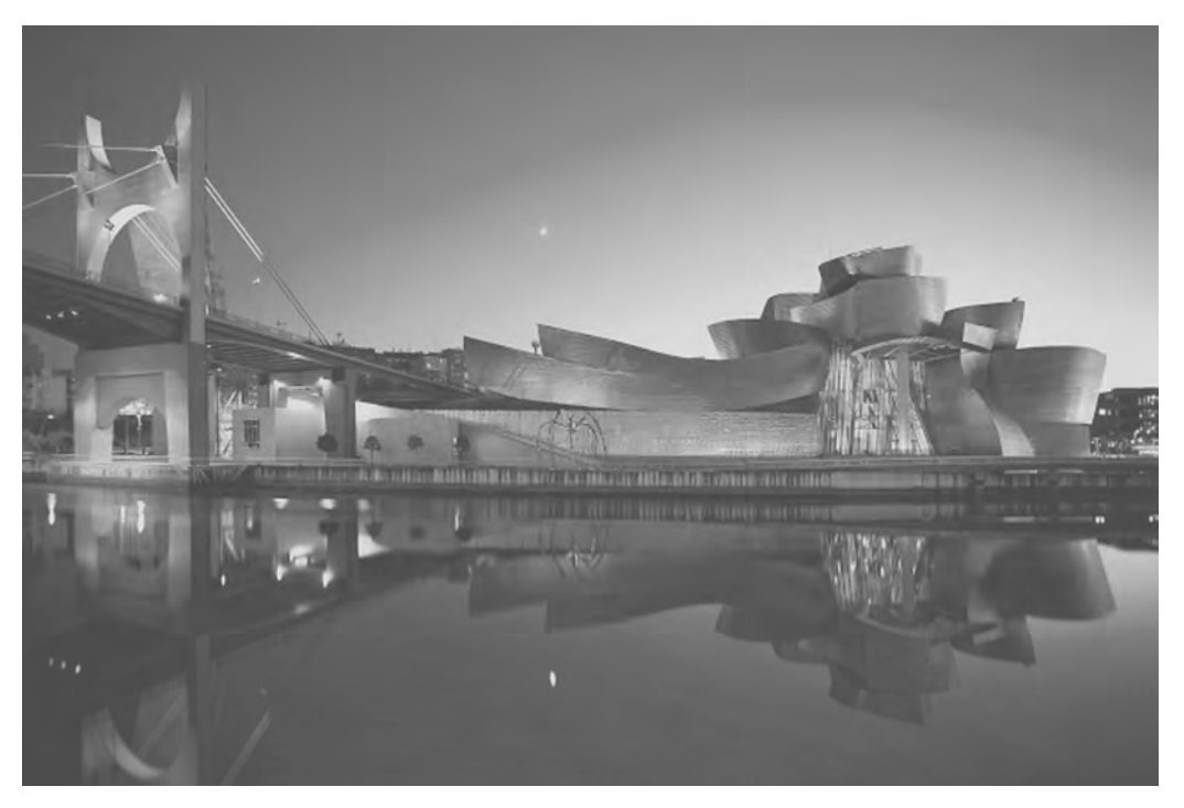
Fig. 8. The Guggenheim Museum Bilbao is a museum of modern and contemporary art, designed by architect Frank Gehry and located in Bilbao, Basque Country, Spain [18]

Contemporary architecture is a common demonstration of possibilities of computer-aided design.