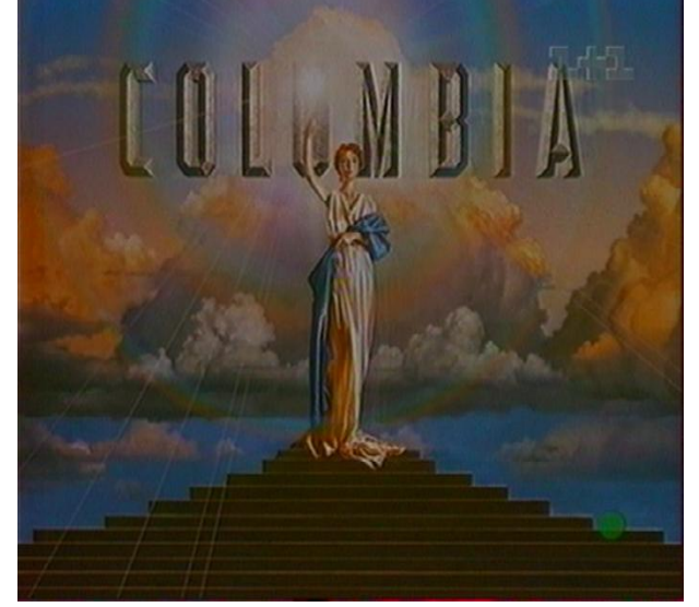
Рис.6. Decrypted image