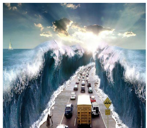
Fig.3. Decrypted image