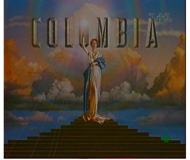
Рис.4. Original image