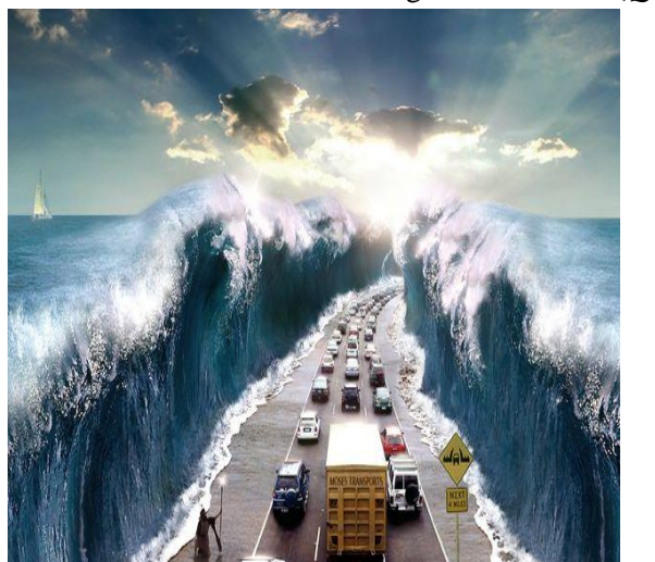
Fig.1. Original image

The results are shown in Fig.1 - 3 at P = 53, Q = 83.