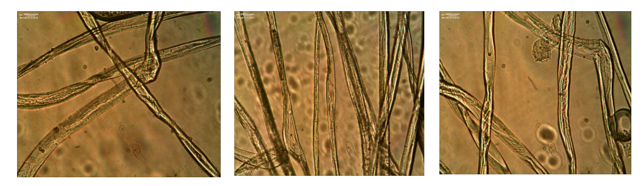
Fig. 3. Kinds of textile fiber damages by microorganisms (on the example of cotton fibers, x400): – swelling (class B)