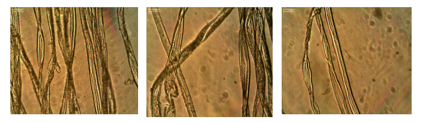
Fig. 4. Kinds of textile fiber damages by microorganisms (on the example of cotton fibers, x400): - wall damage (class B)