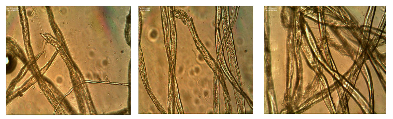
Fig. 5. Kinds of textile fiber damages by microorganisms (on the example of cotton fibers, x400): – granular disintegration (class C)