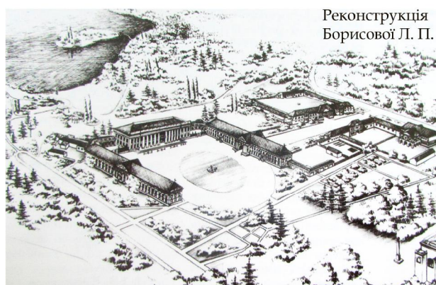
Fig. 4. Estate reconstruction (Borisova, 1974 )

The pediment tympanum of the eastern and western wings was filled with a high relief heraldic composition and weapon attributes included ancient torsos wearing the cuirass and the helmet with count crown flanked the weapon and prolonged shields (Fig. 5). The latter contained the monogram of the letters “SP” meaning Stanislav Pototskyi. From the side of accessed road the shield of the tympanum have the family arms: to the left – “Pilawa” of Pototskyi family, to the right the fan of seven ostrich feathers – the arms of the Mnishkek family (Lobko, 2008).