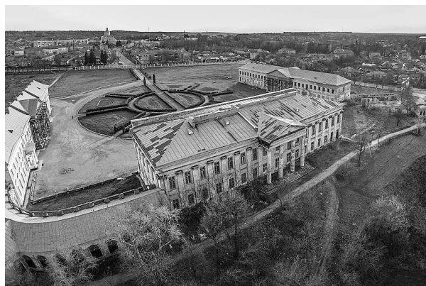
Fig. 5. Main axis palace-cathedral”. (Rytus, 2016)

The problem of sewerage and heating systems in the palace was solved in up-to-date way. The water closets had to be situated in a middle part of the main building as well as in the three places of the wings. The vertical canals joint with the horizontal ones led up to the ground floor of each building under the floor. Further canals connected them with the reservoirs hidden in the ground at the bottom of the garden. The heating was provided due to the canals placed in the inner walls of both floors. Apart from the marble fireplaces, which gave only inconsiderable increase in temperature, some premises of the palace contained the stoves. Several such stoves had been preserved yet to the postwar period (Rolle, 1864).