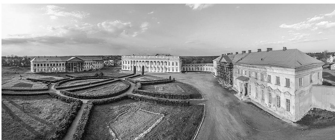
Fig. 1. The Pototskyi Palace in the town Tulchyn. Photo by M. Rytus (2017)

The historic preconditions of creating the palace ensemble in Tulchyn trace their roots to the 15 th century. Modern Tulchyn is a district center located in the south part of Podillia Plateau, 82 km from the region center of Vinnitsia. The town came into being in the 15 th century in the territory that at first constituted the Grand Prince Land Fund of Lithuanian state (Setsinski, 1911). The Polish historians of the 17 th century assume that this settlement had the name of Nestervar and was built on the bank of the river Silnitsia. The main and the first mentions of this settlement date back to the early 17 th century, the time of its belonging to the major Polish magnates Kallinovski by which the castle and a wooden Catholic church were erected (Krzyżanowski, 1862). Due to Zboriv Agreements signed in 1667 Nestervar was added to Cossack regiment of Bratslav Voivodeship, and after Andrusiv agreement signed in 1667 joined Polish-Lithuanian Commonwealth (Guldmann, 1901).