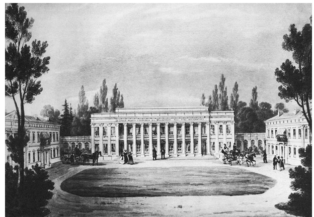
Fig. 3. The palace. Watercolor by Rikhter, 1835

In Lenin Street in Tulchyn there is another palace built by Shchesny Pototskyi for his wife Josephine, so called the “new” one, which is less by the size and is inferior in architecture and grandeur but, at the same time, is no less well-known (Malakov, 1980). The old and the new palaces were linked by the underground passage with the width that let take a ride of the four horses.