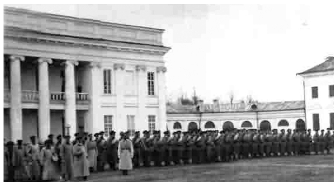
Fig. 7. Photo of the palace in 1912