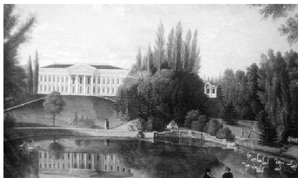
Fig. 6. Park. Watercolor. Early 19 th century