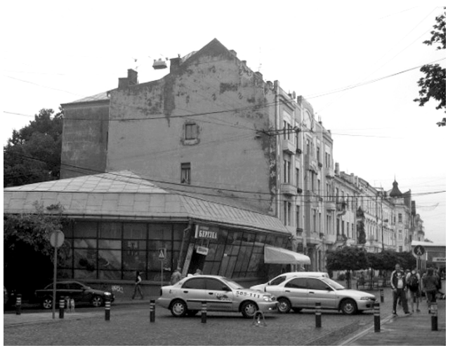
Fig. 8. The view of Kobylianska st. from Armenian str. in Chernovtsy. The current situation. Photo [13]