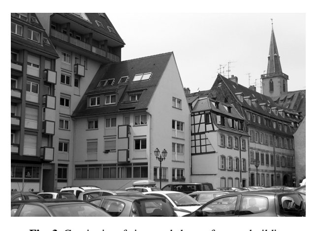
Fig. 3. Continuity of sizes and shapes for new buildings. Strasbourg, France.