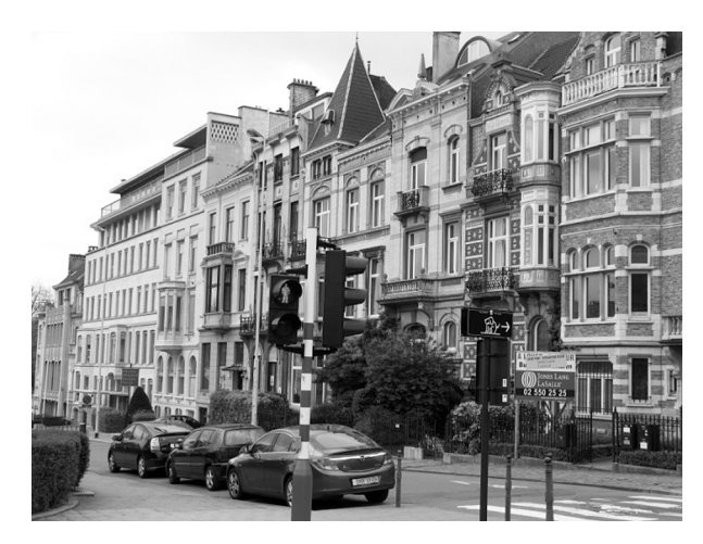
Fig. 1. Hidden restoration. Brussels, Belgium.