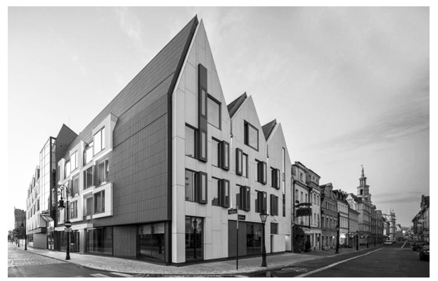
Fig. 6. A new accent angle fixation in the historical environment. Poznan, Poland. Photo [12]

In addition, the new buildings would be not only harmoniously integrated into it in their volumes, stories, forms, architecture and functionality, they also must be energy efficient. Energy efficiency and independence from fossil energy sources is one of the main issues in the sustainable urban development strategy.