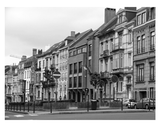
Fig. 2. Imitation of the historical forms in the new buildings. Brussels, Belgium.