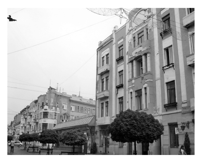
Fig. 7. The buildings of Kobylianska Street in Chernovtsy, Ukraine. The current situation. Photo [13]

The project of the new building was aimed at creating the sustainable architectural solution of the historic street renewal, so it was necessary to take into account the existing urban environmental context as much as possible. First of all, it is the existing town-planning situation, according to which this new building is not just an ordinary insert, but the new accent, that fixes the corner. Therefore, its architectural solution should be subordinated to the existing ordinary historical buildings and at the same time be allocated as the new accent of the street, stressing the intersection of two streets and determining the main direction of pedestrian traffic. It should take into account the nature of the surrounding buildings, which was formed under the influence of historical, natural and climatic, regional building and architectural features, social and economic factors, and at the same time it should bring the new life impulse to the existing urban environment.