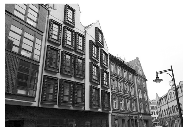
Fig. 4. Stylization of the new buildings. Legnica, Poland.

The principle of harmonious complement is aimed at ensuring the sustainable development of the historical urban environment. The new, added building receives the new forms, but is subordinated to the historical (Fig. 5). The new buildings should be regulated and subordinated to historical buildings by composition, scale, number of stories, forms and parcels of facades. Herewith, it is correct to use regional features in the formation of the volume of the new building (traditional forms of roofs and facade details).