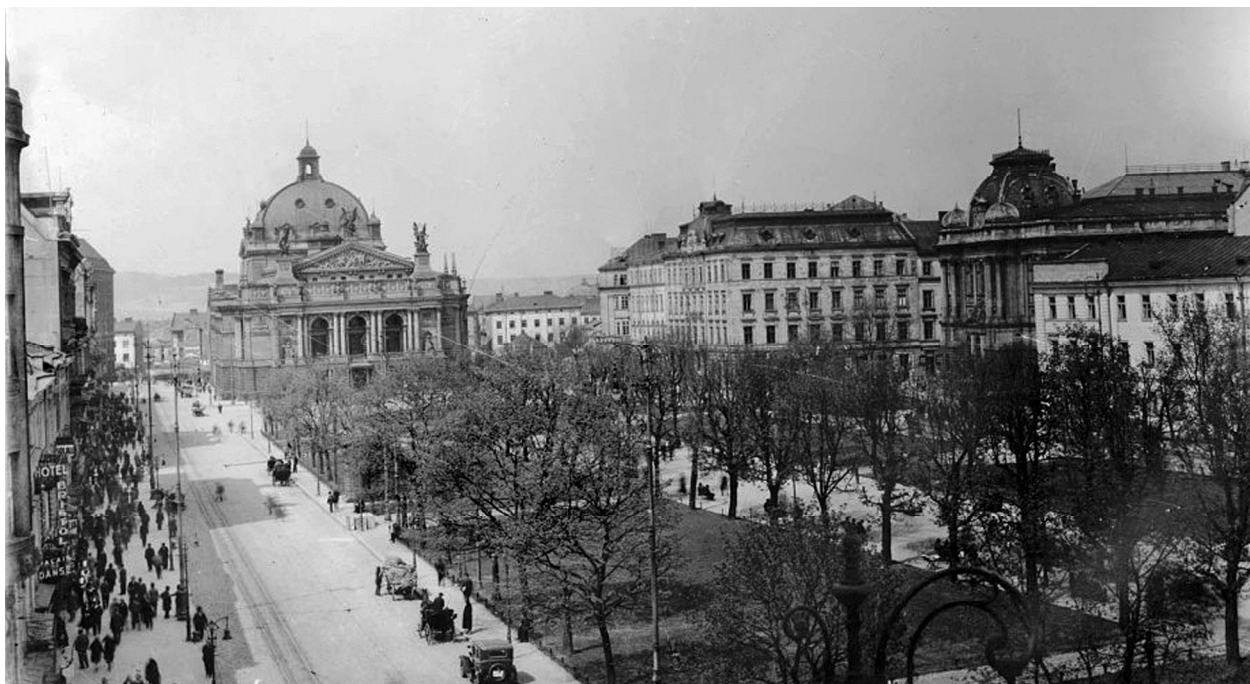
Fig. 1. The view on Karl Ludvig Avenue (today – Svobody Avenue) on Hetmanski Valy in Lviv. Photo of early XX century

In urban spaces forming natural features played an important role: putting Poltva River into the collector and creating Karl Ludvig Avenue (today Svobody Avenue) on Hetmanski Valy created compositional axis, which stretched to the newly built city theatre and continued along the underground river Poltva (today Shevchenko Avenue) (Fig. 1). Hetmanski and Hubernatorski Valy became the planning basement for Boulevard Ring – “Lviv’s Corso” like in European cities – “Krakiv’s planty” or “Ring in Wien”.