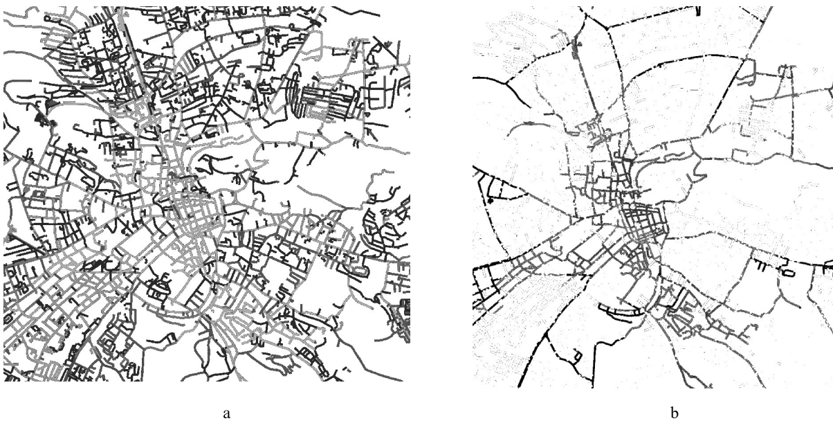
Fig. 2. Street network of the central part of Lviv city: a – a common network, b – identified as “prior spaces” according to the B. Hilliers method.

means depth). It is defined that the criteria for “priority space” by B. Hillier in Lviv is the rectangular network of streets at the Market Square and the area around it (Fig. 2, a, б). As well as the space, that has the potential to develop, highways of the city importance are distinguished. That was expected to radial city (Fig. 3). Areas of apartment buildings of 60s-80s are the “patches” in the structure of the city with more resources to development and complications (Fig. 4). This definition is confirmed by the density of these areas with new buildings, especially with new functions. So that Sykhiv, Levandivka, Shchurata streets have had the built-of shopping centres, markets for fifteen years. The first floors of residential buildings have completely been passed into the various types of business. In addition, density of areas usage in these regions has increased, also mainly because of open-typed trading facilities and cafes. In general, the nature of the network of “priority spaces” in Lviv has the patch nature, combined with the centre with the use of radial directions (Fig. 5).