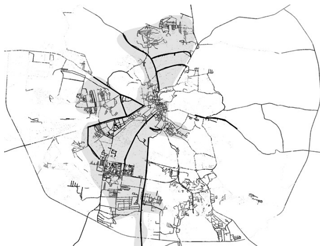
Fig. 5. Territories that will rapidly develop on the basis of street network potential by B. Hillier's theory.

Monitoring the event activity in the city also confirms the B. Hilliers theory about priority spaces of the city and their dependence on the geometry of the street network. The most significant events in the city, both of cultural and commercial nature, and social actions are held in spaces along the streets with the lowest angles of rotation as well as with the nearby streets of the smallest grinding.