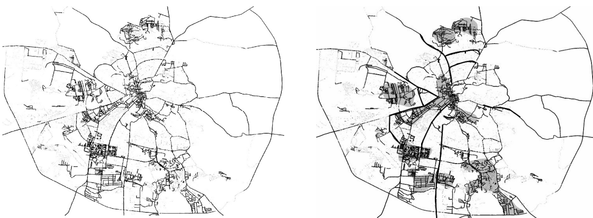
Fig. 3. Preferred fragments of the city street network. Source: analysis of the author.