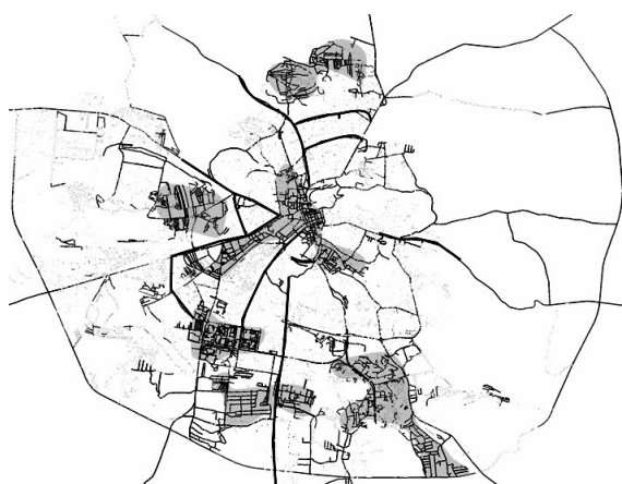
Fig. 4. Areas of the city, that have received impetus to the high-quality development despite the priority of Lviv street network pieces.