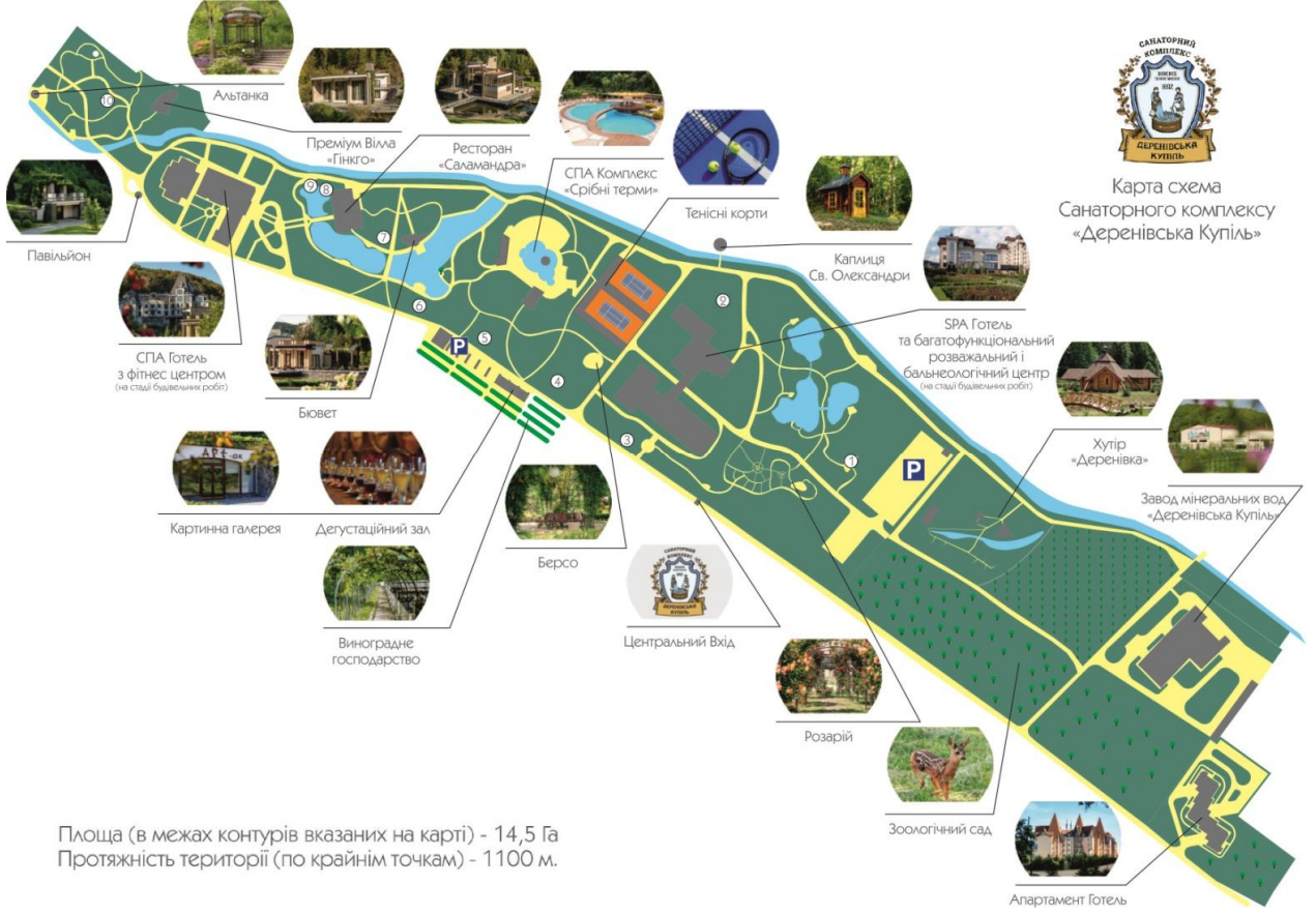
Fig. 1. Mapping scheme of the modern Derenivska Kupil sanatorium complex

Object of research: Derenivska Kupil sanatorium complex located in the tract of Derenivka (village Nizhnie Solotvyno, Uzhgorod district, Transcarpathian region) (see Fig. 1). For the first time, the Derenivka tract was mentioned in archival documents in 1582. During the 4-th century Derenivka was a part of six different states. Currently, the apartment hotel has 44 rooms. The maximum number of guests is 130 people. Usually the hotel is filled about 50 %, depending on the season. Water resources or rather mineral thermal springs which are related to silicon thermal springs are considered to be the peculiarity of the territory where the Derenivska Kupil sanatorium complex is located. They are available only within the limits of the Transcarpathian deflection in places with high geothermal background. The solubility of silicon acid in thermal waters increases significantly. Preferably, these waters are at a depth of 80-660 m. At the general chloride-sodium composition mineralization of water varies within 1-3 g/l to brines. The temperature rises from 23 to 56 °C at the outlet. The content of silicon acid is 50-130 mg/l. The reserves of thermal silicon water according to preliminary estimation are not less than 6000 m^3/day .