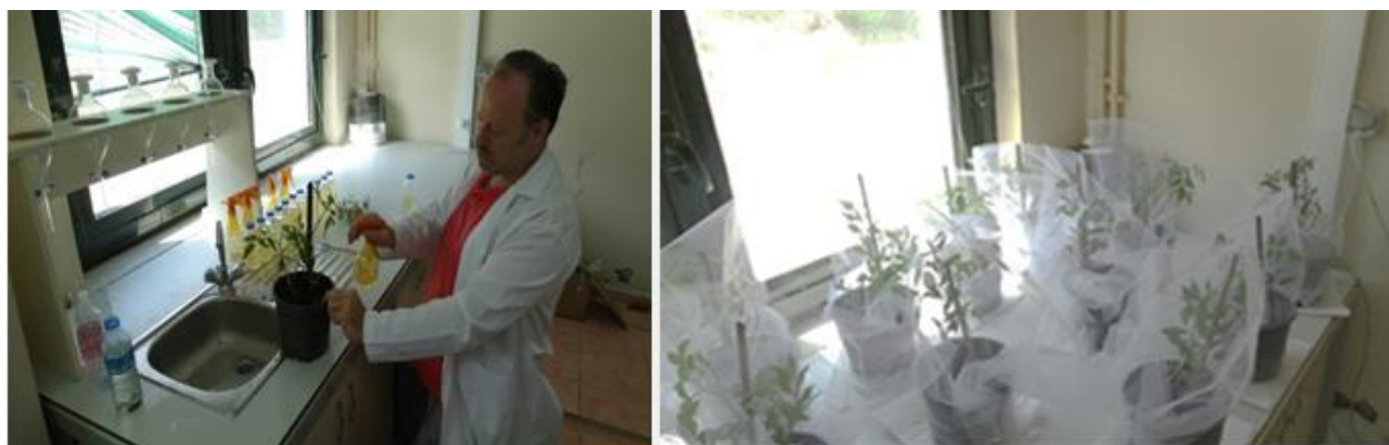
Fig. 1–2. Laboratory application of biopesticides

Following the biopesticides, 5 controls were made in every 2 days, and the alive and dead individuals were counted. In the present study, nymphs of H. halys were collected in the 3 rd week of May. Adults of H. halys were collected in the 3 rd week of August and brought to the Laboratory. Nymphs and adults were brought with beans were placed in wire mesh cages with a size of 20x20x30cm as 20 nymphs and adults in each cage.