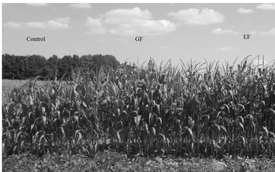
Fig. 2. General view of maize crops with various use of different mineral fertilizer types (2018)

The results of the observations are shown in Table 3.