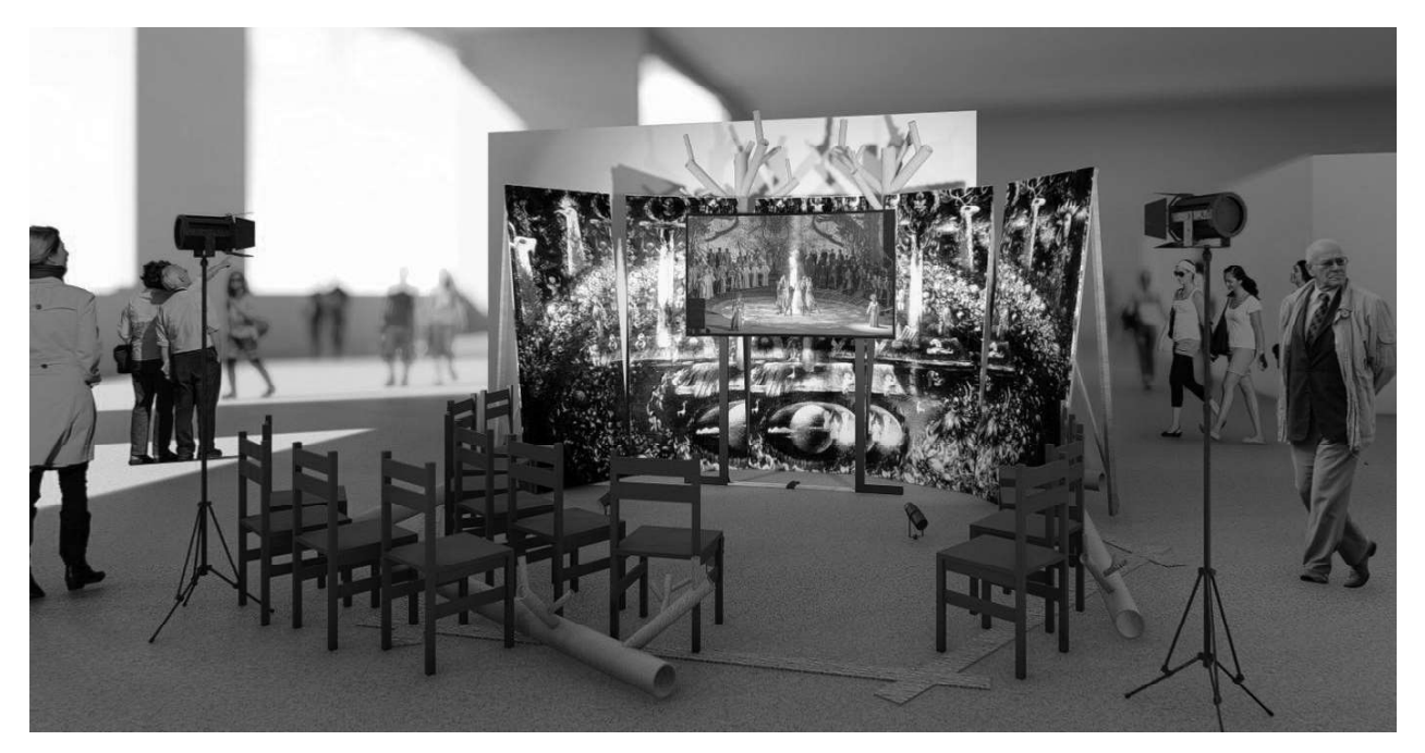
Fig. 4. The proposal for the final space design, the organization of acting and their aesthetic design using horizon-panorama with a copy of the set design sketch by the artist Ye. Lysyk made for the folk opera "When the Fern Flowers."

The horizon, according to the designers, was to be attached to the spatial structures made of five tablets arranged in a semicircle, the task of which was to draw visitors into the depths of the Kupala Drama Theater created by Lysyk and also to separate the space of the pavilion from the mega-space of the exhibition hall (Fig. 4). Not many technical means were used; they included a set of acoustic and lighting equipment, a television screen for showing fragments of performances and all other theatrical events that took place in Ukraine from 2015 to 2019, performances and events held in the First National Ukrainian Theater Pavilion at the PQ 19.