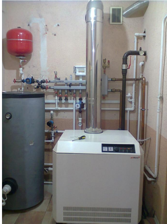
Fig. 1. Boiler room

The flow region with constant velocity and temperature is the core of the jet. Along the axis of the nozzle at a certain distance from its cut is the pole of the jet O. If from it through the boundaries of the cut nozzle to draw rays, we obtain the outer boundaries of the jet.