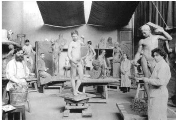
Fig. 6. Sculpture workshop at the Academy of Arts of St. Petersburg, 1913 (Akademiya khudozhestv ...)