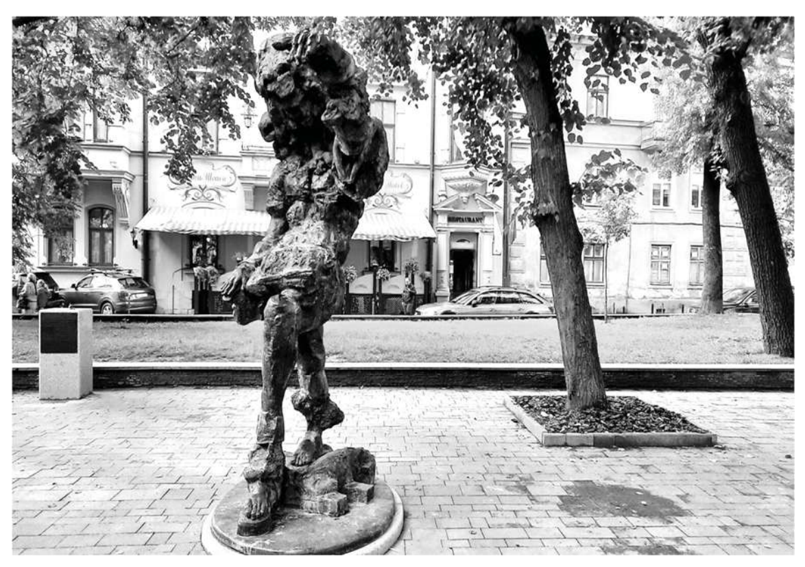
Fig. 1. Monument to Franz Xaver Mozart in Lviv (Chmil L. August 31, 2021)

based on a photo of a model of the statue in his creative workshop (Fig. 2). Among other things, the author was pointed out that the full-size plaster model of the monument was made in a completely unsuitable room, with insufficient ceiling height, which, according to critics, forced S. Schweikert to tilt the statue's head, and noted that this slope was not in the sketch of the work (Fig. 3). On this basis, the author was reproached that the composition of the work arose for purely utilitarian reasons that have no connection with the creative search.