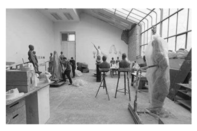
Fig. 5. Sculpture workshop at the Academy of Fine Arts in Prague (Akademiya izobrazitelnykh iskusstv...)

The room should be illuminated by natural light, and the windows should be located on the north side and allow a sufficient amount of even side daylight to enter the workshop. The window in the wall should be arranged on the north side, at a height of 1.5 m from the floor, and end at the top almost under the ceiling. An important condition for the comfortable work of the sculptor is the presence in the workshop, in addition to side lighting, also upper one (Fig. 5).