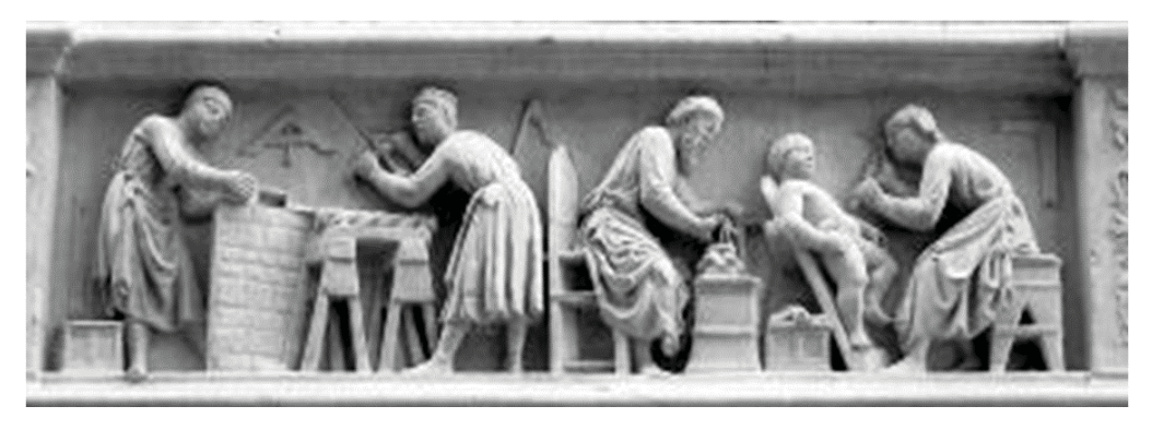
Fig. 4. Nanni di Banco, relief showing stone and woodcarvers, c. 1416, marble, commissioned by the Guild of Stone and Woodcutters (Culotta A. The role...)

One of the opportunities to get acquainted with the sculptor's workplace is provided by memorial museums created in the workshops of famous artists. There are such museums in many cities of the world, they exist in Ukraine, and in Lviv in particular. Such, for example, is the Museum of Theodosia Bryzh in Lviv, created in the room where the artist worked in 1956–1999, which is part of the Lviv National Gallery of Art named after B. Voznytsky (Muzey Teodoziyi...). Ivan Kavaleridze Museum-Workshop operates in Kyiv (Muzey-maysternya...), in St. Petersburg, there is a Memorial workshop of Mikhail Anikushyn (Masterskaya ...) and in Moscow, there is a Museum-Workshop of Anna Golubkina (Muzey-masterskaya...). There are many such museums, but it should be noted that most sculptors worked in unsuitable buildings, which could not provide a full cycle of sculpture creation and models of monumental works of sculpture had to be performed in areas adapted for this purpose. In Lviv, such needs were provided by an Experimental Ceramic and Sculpture Factory. But even a visitor to these museums can get a sufficient idea of the features of organizing the sculptor's workplace. There are rare examples when workshops were built specifically for the needs of sculptors. These are several creative workshops located on Karpatska Street in Lviv. According to an individual project, the house workshop of sculptor Alice Trepp in Switzerland was built (Bozhko O. Dom-masterskaya...).