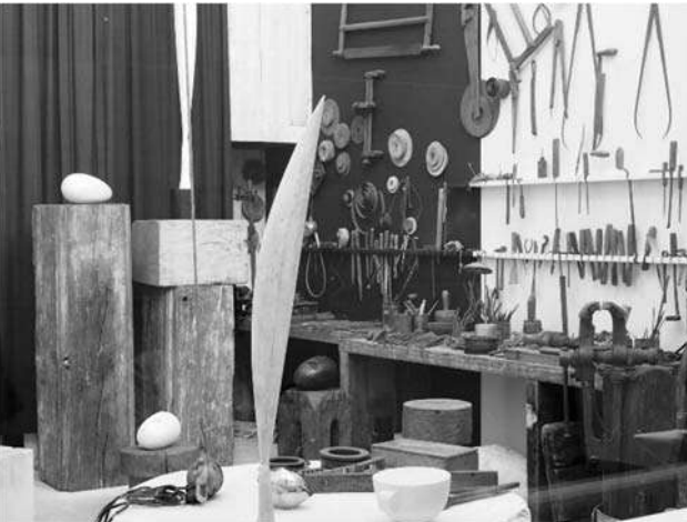
Fig. 9. Sculpture workshop at the Pennsylvania Academy of the Fine Arts (Sculpture facilities)