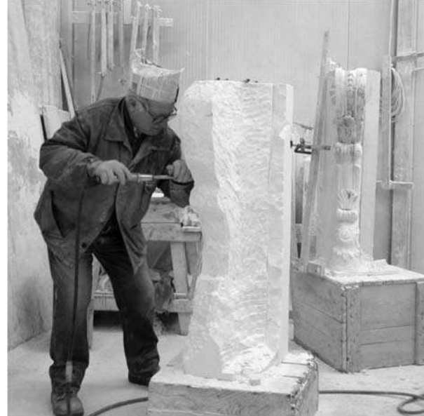
Fig. 11. Sculpture workshop at the Pennsylvania Academy of the Fine Arts (Sculpture facilities)