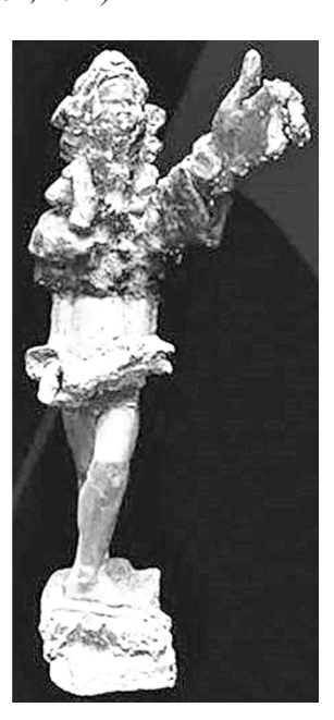
Fig. 3. Sketch model of the monument to Franz Xaver Mozart (Lishchenko Y. April 30, 2021)