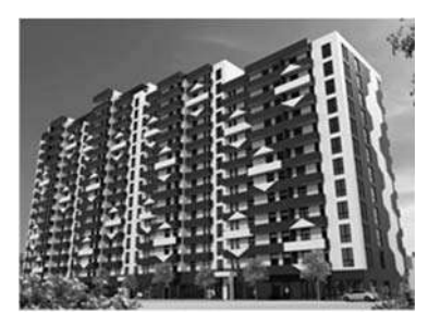
Fig. 6. The HE "Bumblebee"