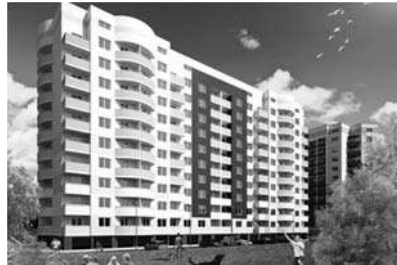
Fig. 8. The HE "Monet"