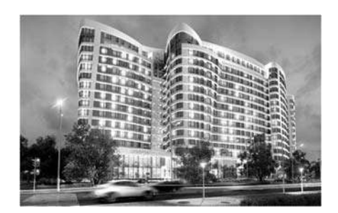
Fig. 4.3 The HE "Parus Park"