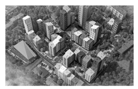
Fig. 7. The HE "Semytsvit"