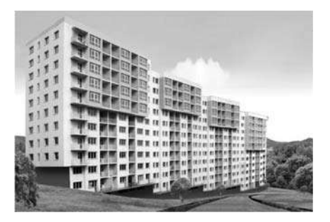
Fig. 10. The HE "Panorama"