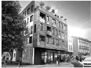
Fig. 11. The HE "Baker Street. Sherlock Holmes"