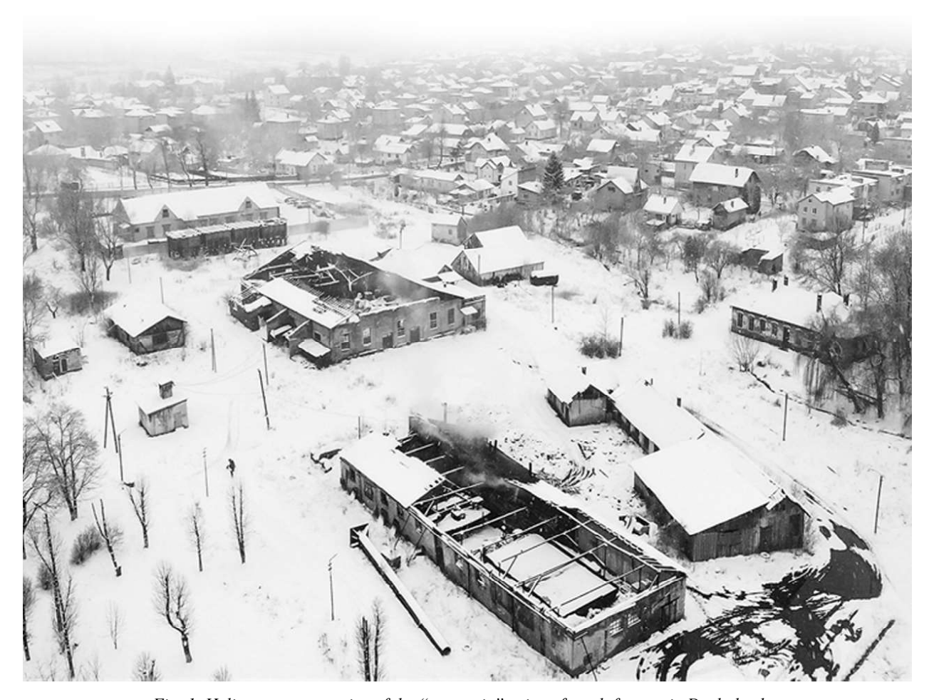
Fig. 1. Helicopter perspective of the "romantic" ruins of a salt factory in Drohobych.

supposed to get acquainted with both the space and environment of enterprises, their technologies, the composition of industrial buildings, and with the history, genesis and development of industry in Kaiserslautern and Drohobych, their culture and contribution to the development of European and world human civilization. But in the context of the Covid-19 pandemic, which the organizers encountered during the seminar, it made it impossible to implement it in Germany. Therefore, it was decided to concentrate all activities in Ukraine, in Drohobych. Also, it was decided to conduct the exchange of information (about previous surveys of the Drohobych salt factory and other industrial facilities, about historical events in the city and its origin, personalities that formed the intellectual potential of the city and region, and the design itself) online.