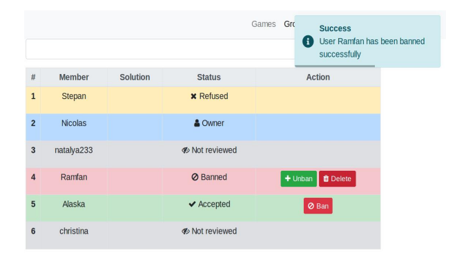
Fig. 6. The web-page with students results

The user of such a system needs to log in to be able to submit his/her solution. The solution (programmed game logic) is sent by the user as an executable file. Each user-written program (hereinafter bot) can be tested in two ways.