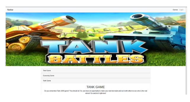
Fig. 4. The main page of the web-portal

The main page is presented in Fig. 4. This page is used for the authorization too.