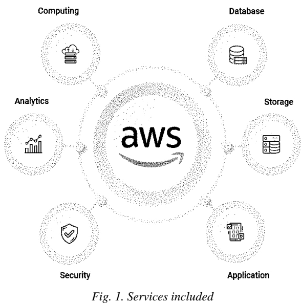
in the AWS complex

The cost of the service is paid for each hour, and some options are paid on a monthly basis. If the client plans to use EC2, then it is recommended to use the reservation function. The subscriber pays for 3 months of work at once, and the total cost becomes one and a half times lower.