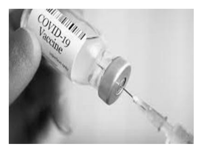
Fig. 2. Vaccine against coronavirus infection

This technique allows the body to prepare for a possible encounter with the "real" pathogen and to ensure an easier course of infection, if it occurs. The example of the vaccine versus coronavirus infection is shown in Fig. 2.