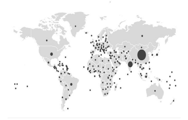
Fig. 4. COVID - 19 Vaccination site (map)

And the last service I would like to consider will be COVID-19 Vaccinations from Oxford Martin School [11]. As the creators of the site say in their Data Explorer all can see full data about COVID-19 vaccinations (doses administered, people with at least 1 dose, and people fully vaccinated).