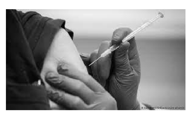
Fig. 1. The process of vaccination against coronavirusinfection

Vaccine is a preparation made on the basis of weakened or killed pathogens, products of their vital activity or their synthetic analogues. Currently, computer methods are used to develop vaccines based on data (data banks) of genomic sequences of many bacteria. pathogens of parasitic infections and viruses. The administration of the vaccine mimics a disease that allows the body to identify the pathogen and "learn" to fight the pathogen by producing specific antibodies [7–8].